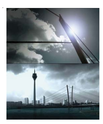
Deutsche Oper – TV Commercial - Locomotion (2005)