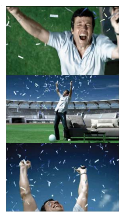
o2 Data Lothar - TV Commercial - Locomotion (2006)

Particles for the confettis (Maya) Tracking (Boujou) Support (Shake, Photoshop)