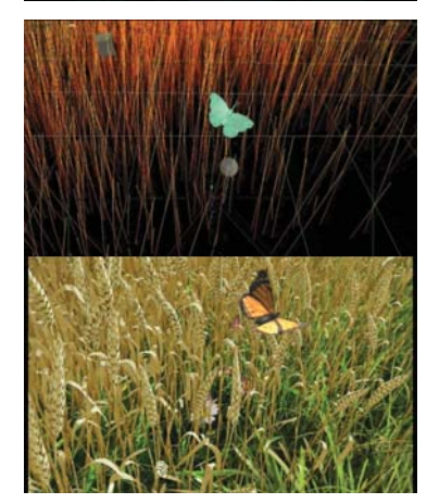
Yofibra – TV Commercial - Locomotion (2008)

Shading, Lighting of the mobile phone (Maya)