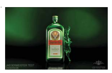
Jagermeister – Internal Project - Locomotion (2009)

Modeling of the bottle (Maya) Shading, Lighting, Rendering (Maya)