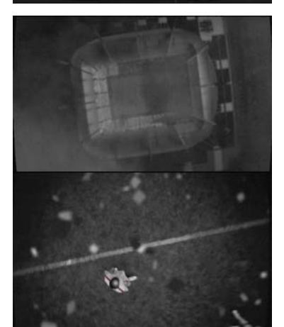
Ursus – TV Commercial - Locomotion (2009)

Animation, Lighting, Rendering (Maya) Compositing (Fusion)